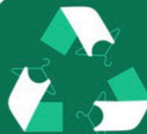
Uniform Shop Lead