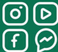
Social Media Lead